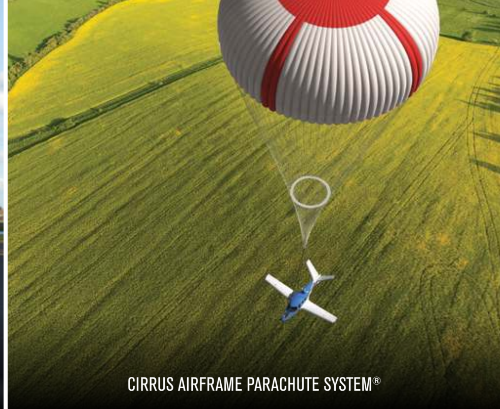
CIRRUS AIRFRAME PARACHUTE SYSTEM®