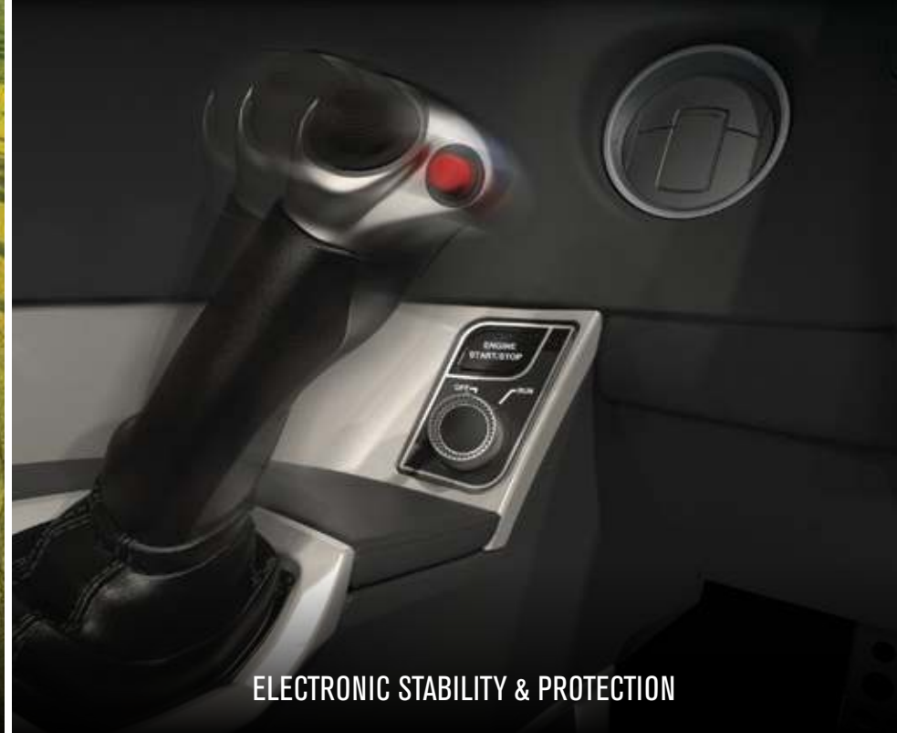
ELECTRONIC STABILITY & PROTECTION