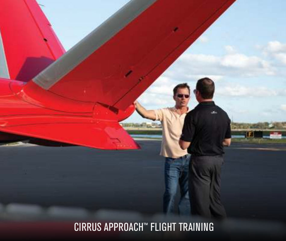
CIRRUS APPROACH™ FLIGHT TRAINING