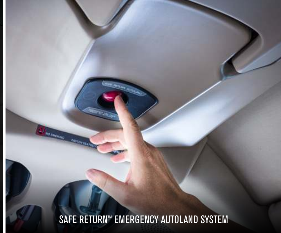
SAFE RETURN™ EMERGENCY AUTOLAND SYSTEM